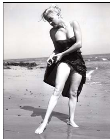
Photos of Jeanne Carmen in her Hollywood years

The lives of Hollywood celebrities is always a subject of interest to the audience of fans. I remember you wrote an interesting book dedicated to the memory of your mother titled "Jeanne Carmen: My Wild, Wild Life as a New York Pin Up Queen". How and when born the idea of this book?